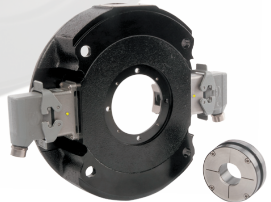
RIM Tach 1250 NexGen (RT1)