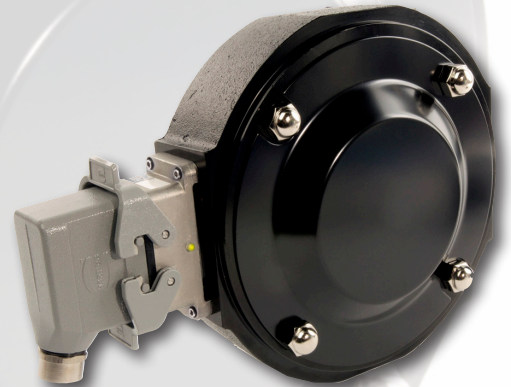
RIM Tach 8500 NexGen (RT8)